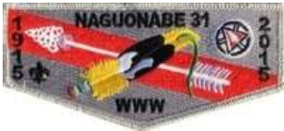
31B Naguonabe S27 2015 | OA BBV6:

2015 NOAC OA 100th; top of participant set, goes with X14