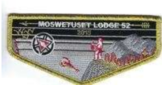
52C Moswetuset S59