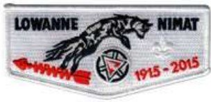
219C Lowanne Nimat S15