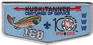
168B Kuskitannee S49