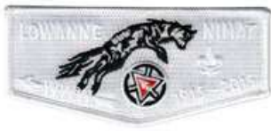
219C Lowanne Nimat S17