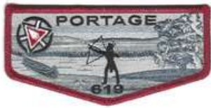
619A Portage S35