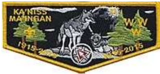
196C Ka'Niss Ma'Ingan S13