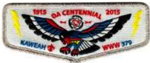
379A Kaweah S38 2015 | OA BBV6: