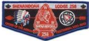
258A Shenandoah S68 2015 | OA BBV6: