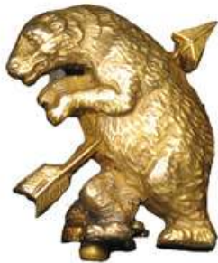
7A Moqua PIN1