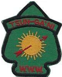
144A Tsun-Ga'Ni YA1a