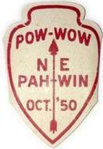
161A Ne-Pah-Win L1