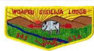
343B Woapeu Sisilija S1 | OA BBV6: S1

BSA; 63x126 Taiwan; water buffalo; FF; bdr same color as sky