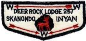
256A Deer Rock F1 | OA BBV6: F1