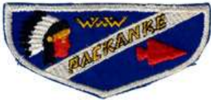
419A Packanke F1 | OA BBV6: F1