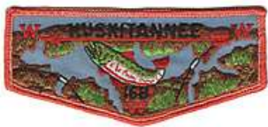
168B Kuskitantee F1 1973 | OA BBV6: F1