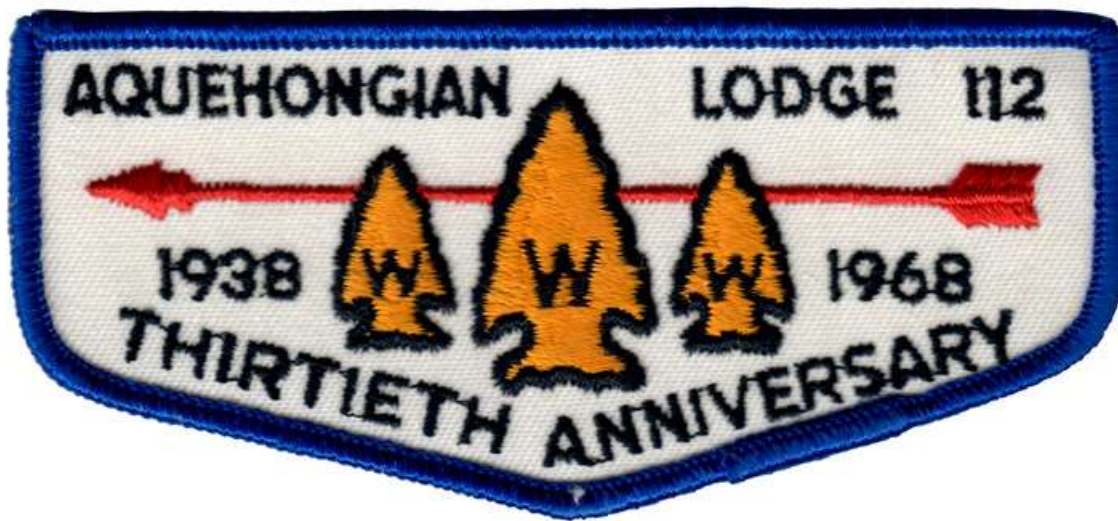
Aquehongian F5 1968