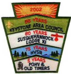
[ ] eX2002-1 2002 | (OA BBV6: EX2002-1)