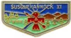
[ ] PIN1 1980'S