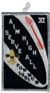
[ ] eX1991-1 1991 | (OA BBV6: EX1991-1)