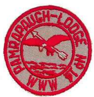
[ ] R2 a