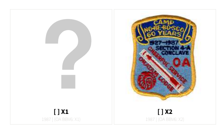
E - EVENT ISSUES